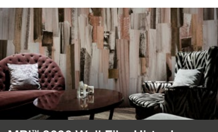
MPI<sup>™</sup> 8626 Wall Film Hi-tack

DISCLAIMER - All Avery Dennison statements, technical information and recommendations are based on tests believed to be reliable but do not constitute a guarantee or warranty. All Avery Dennison products are sold with the understanding that purchaser has independently determined the suitability of such products for its purposes. All Avery Dennison's products are sold subject to Avery Dennison's general terms and conditions of sale, see http://terms.europe.averydennison.com