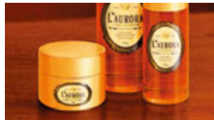
For short-run production of labels and stickers