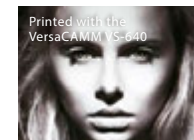
Printed with the VersaCAMM VS-640

VersaCAMM VS-i supports the new light black (Lk) ECO-SOL MAX2 ink, providing highly accurate colors and seamless gradations. With light black, you can achieve a neutral gray for smooth gray scale gradations and precise photographic images, or produce natural, smooth reproduction of skin tones containing light and medium hues. Light black also assists with accurate color reproduction for corporate branding material, such as clothing or cosmetics promotions.