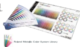
Roland Metallic Color System Library