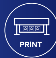
SG2 series (2 heads)