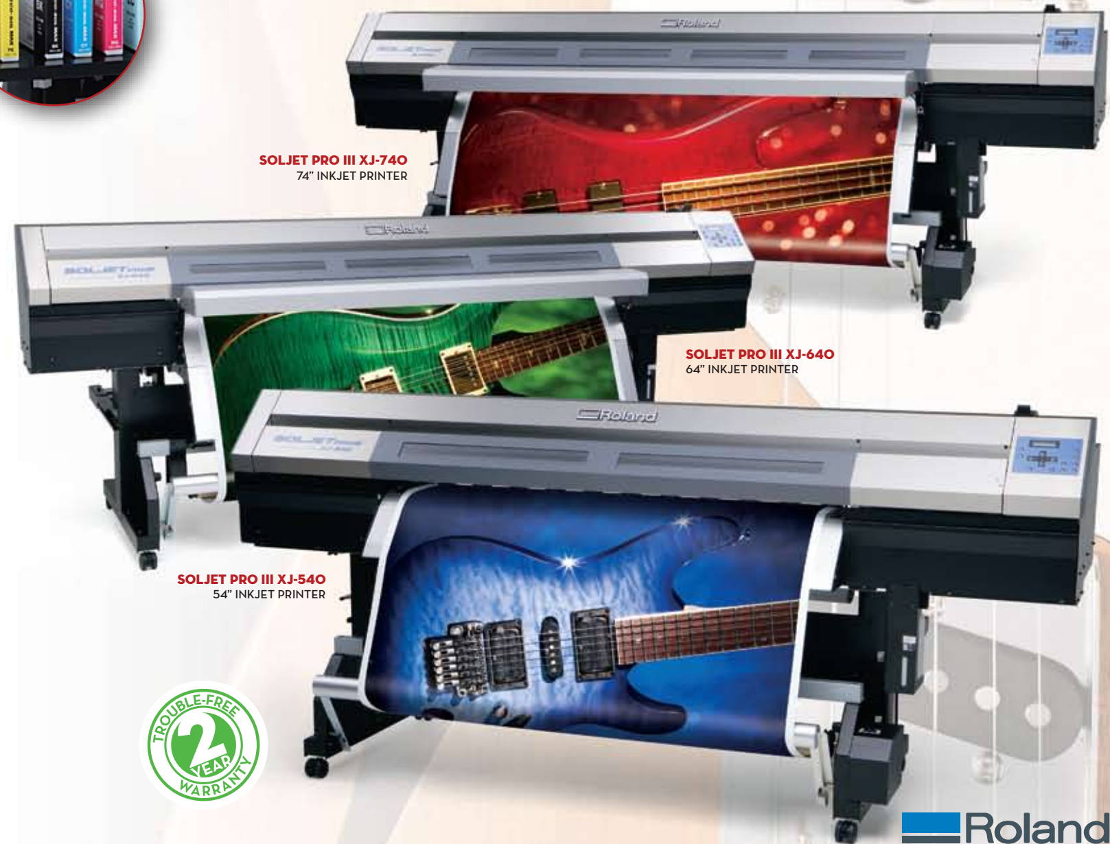
SOLJET PRO III XJ-740 74" INKJET PRINTER

Vibrant images that pop, crystal-clear details that sparkle, subtle gradients that blend without banding, spot colors that hit the target. That's the kind of performance you should be looking for in your printer.