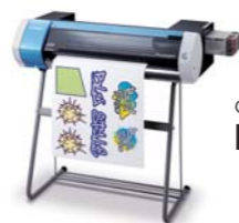
Optional Stand PNS-24

About Metallic Silver Ink Due to the nature of the metallic silver ink, the pigment in this ink will settle in the cartridge and ink flow system, requiring you to shake the cartridge before each use. Outdoor durability is three years for CMYK inks, one to three years for metallic silver ink, depending on the media used. Roland strongly recommends lamination for both indoor and outdoor graphics to ensure the quality of metallic silver ink.